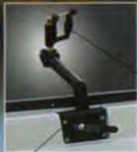
Patented Universal Pitch™